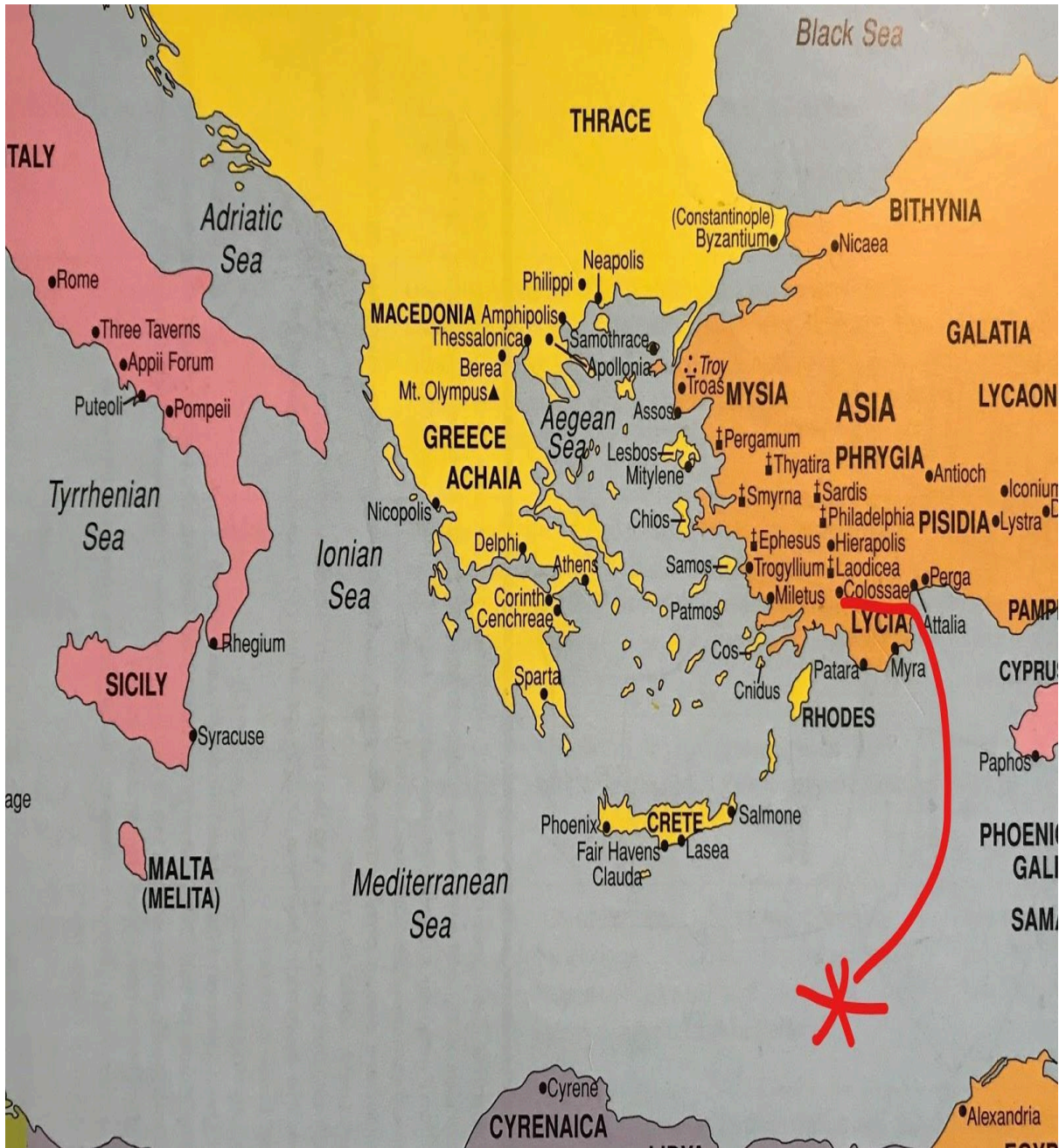
MAP SHOWING CITIES DURING THE APOSTLE PAUL MISSIONARY JOURNEYS.